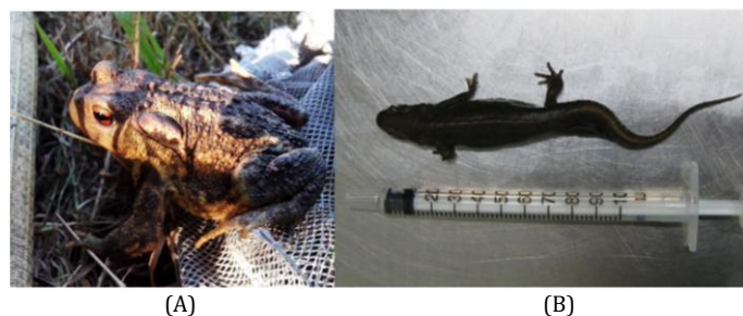
Figure 1. A: a common toad ( Bufo bufo [Linnaeus, 1758]), and B: a Bosca's newt ( Lissotriton boscai [Lataste, 1879]).

Pesticides can be found within the environment through multiple channels. They can disperse into the atmosphere (diffusion into the upper layers, deposition into the water, deposition into the soil), water systems (evaporation into the atmosphere, entry into groundwater, entry into bottom sediment, absorption by algae and plants, absorption by micro- and microorganisms) and soil (evaporation into the atmosphere, entrainment by surface drainage drains, infiltration into groundwater, accumulation in plants, accumulation by soil micro- and macroorganisms) 14,24 . Another route is over the trophic connections, which can be through the entry through food facilities, the consumption of amphibians by predators, or the Human